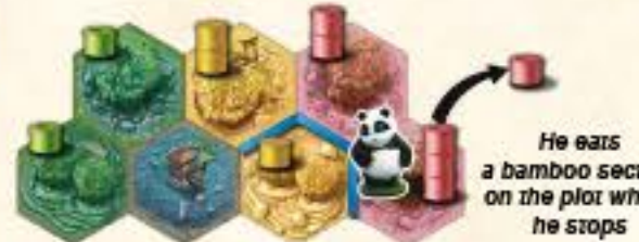
He eats a bamboo section on the plot where he stops