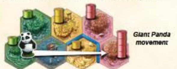
Giant Panda movement

The player keeps this Bamboo section on his individual board. It can be used to fulfill a Giant panda objective.