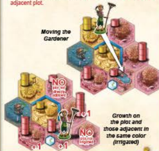
Moving the Gardener

Growth on the plot and those adjacent in the same color (irrigated)